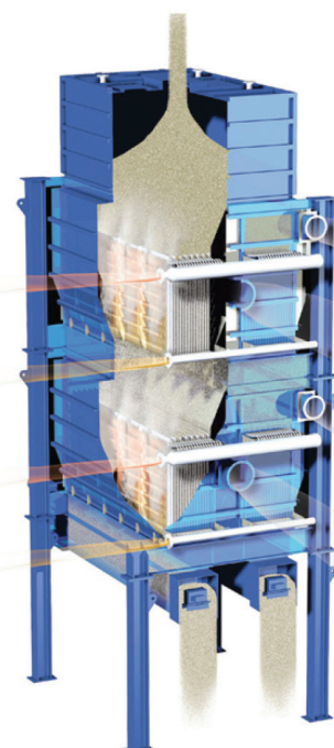
FIG 3. Plate bank heat exchangers (dryers) are energy efficient and can offer greater operational flexibility

Plate bank heat exchanger dryers (Fig. 3) are recommended for any manufacturing facility looking to gain green points for environmentally friendly technology use. Installation of such dryers, as pre-conditioners or residual dryers, will reduce emissions and load on otherwise energy intensive dryers, thus improving the overall energy efficiency of the facility and ultimately increase production capacity.