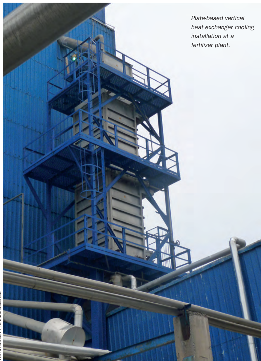
Plate-based vertical heat exchanger cooling installation at a fertilizer plant.

An industry-wide push for greater environmental accountability is driving the need for improved fertilizer cooling methods. Not only is indirect cooling technology more environmentally-friendly, says Igor Makarenko of Solex Thermal Science, it also provides fertilizer manufacturers with a better product.